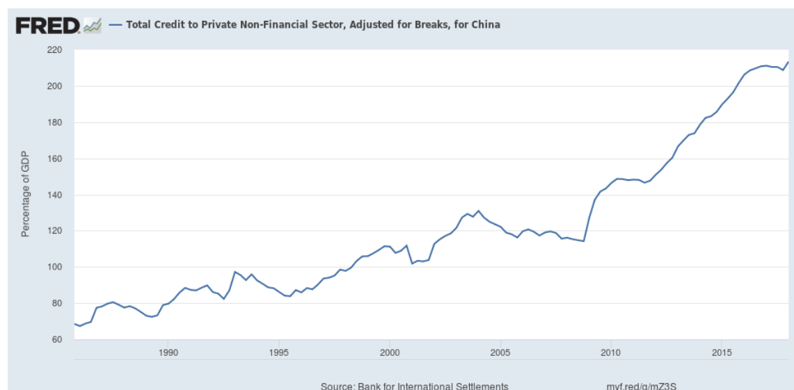
Table II. TOTAL CREDIT TO THE NONFINANCIAL SECTOR, ADJUSTED FOR BREAKS IN CHINA 1997-2017

According to the Bank for International Settlements, the percentage of China's total credit to the private non-financial sector for China, Q1 of 2017 was 211.1% of GDP. By Q4 of the same year, China's private non-financial sector was 208.7% of GDP. 22 Overall, the partial convertibility of the RMB has been increased, with respect to the development of total credit to private non-financial in terms of GDP percentage the annualized rate of Q4 2017 and Q1 2018 was a 10.80% increase. Overall, convertibility of the RMB outside of China is still limited because of the